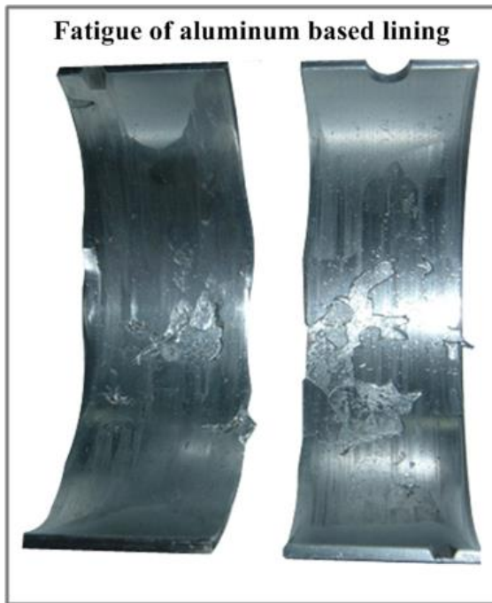
Fig.2 Fatigue of aluminum lining of bi-metal bearings