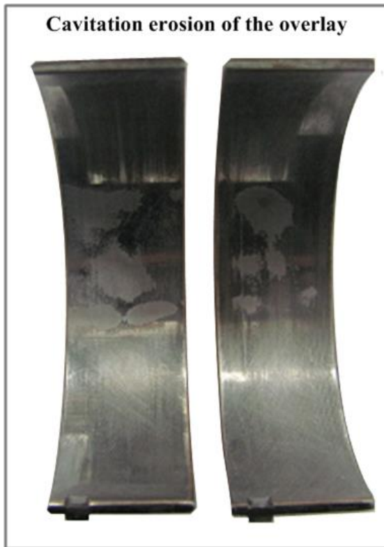
Fig.7 Cavitation erosion of soft lead based overlay