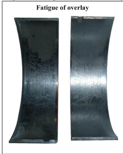
Fig.3 Fatigue of the overlay of tri-metal bearings

fatigue of the exposed intermediate layer.