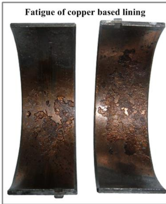
Fig.4 Fatigue of the copper based intermediate layer of tri-metal bearings

The table below presents different factors causing fatigue and the methods of preventing bearing failures due to fatigue.