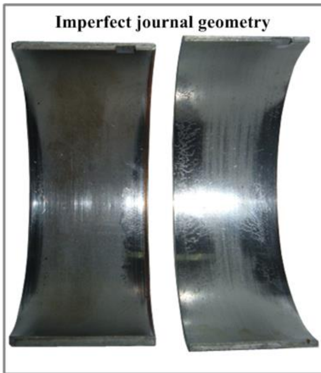
Fig.6 Imperfect journal geometry

shape journal, edge parts of hour glass shape journal) come to metal-to metal contact (boundary lubrication) with the bearing surface. The metal-to-metal contact causes excessive wear. Fatigue cracking of the bearing materials may occur in the contact areas.