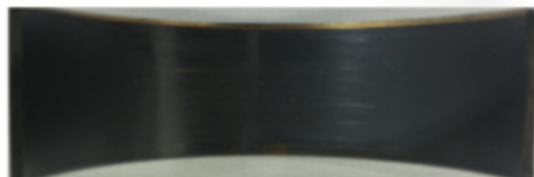
Steel Bronze Bearing

Coated bearings tested at 11,600 psi (80 MPa) for 24 hrs. are depicted in Fig. 2.