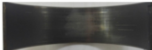
King Engine Bearings