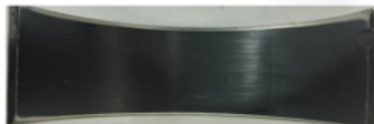
Steel Aluminum Bearing