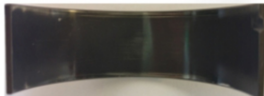
Fig. 4 – King aluminum alloy HP bearing coated with K-40 after direct friction test.

The image of a bearing tested under continuous direct contact with the crank journal is depicted in Fig. 4.